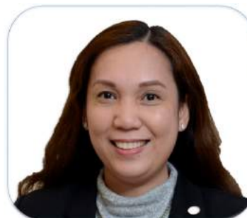
KRIZIA Z. TAN Travel Agency Travel Best