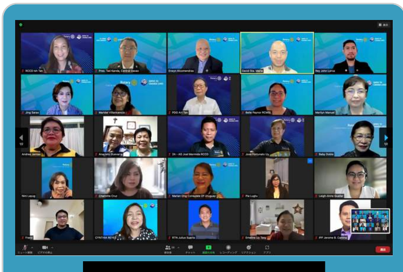
Acquaintance E-party and Joint Meeting with RC Makati San Lorenzo