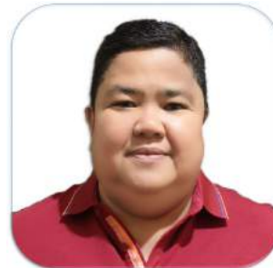
VILLA MERCEDES SILVA Apartment Rentals