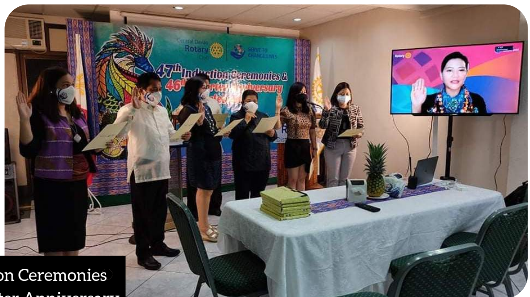
47th Induction Ceremonies and 46th Charter Anniversary Celebration